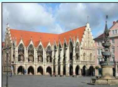
Old City Hall