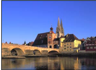
Stone Bridge & Old Town