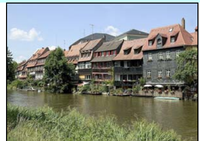
Old Fisherman Houses

The history of Bamberg's fascinating townscape goes back more than a thousand years. This UNESCO World Heritage Site was built on seven hills and is often compared with Rome. On one of the hills stands the imperial cathedral with its four towers, the heart of the town and the region's most important architectural monument. Other local attractions include the old town hall in the middle of the river Regnitz, the Old Fisherman Houses and the New Palace with its rose garden.