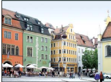
Old Market Square