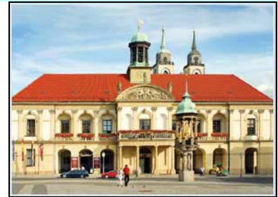
Old City Hall

Throughout its history this town in the German State Saxony-Anhalt on the River Elbe has been subjected to devastation and destruction and enjoyed frequent periods of prosperity, and this is still very much reflected in the current townscape. Architectural monuments dating from all the historical periods such as the imperial cathedral and Monastery of Our Lady hark back to the former glory and wealth of this former centre of imperial power.